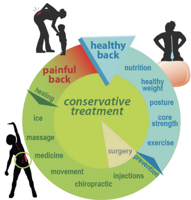
Figure 2. Most people with acute low back pain respond rapidly to non-surgical treatment. Exercise, strengthening, and ideal weight are key elements to your treatment. Make these a part of your life-long daily routine.

Most people with acute low back pain respond to treatment. 90% are symptom-free within 1 to 2 weeks and 10% recover within 3 months. A positive attitude, regular activity, and a prompt return to